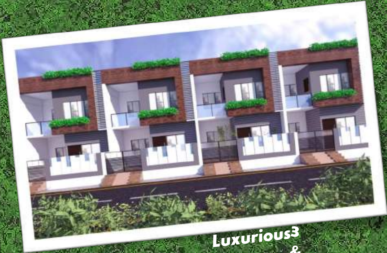
Luxurious 3 & 4 BHK Bungalows