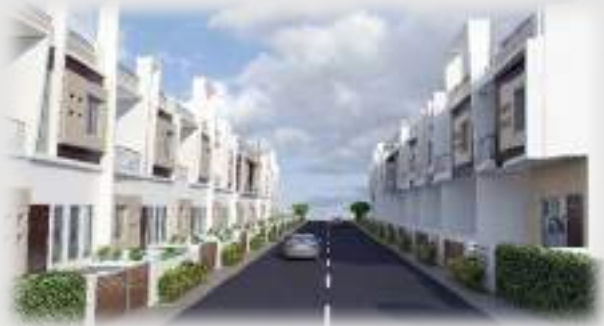
Sai Sagar Villas Opposite St. Mary School, Titardi, Udaipur